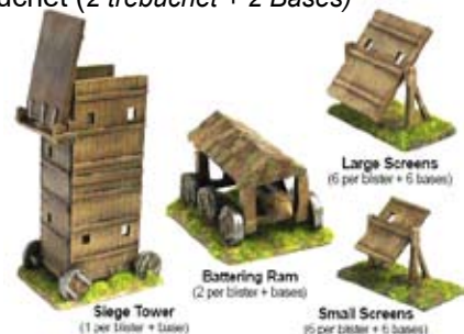
Siege Tower (1 per blister + bases)